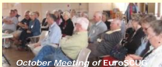
October Meeting of EuroSCUG

There is also one centralised all member meeting each month at the Moruya Golf Club. At this main meeting there is a guest speaker and morning tea; then instruction in computing issues according to demand. ASCCA has been told that visitors from other clubs are most welcome at their meetings.