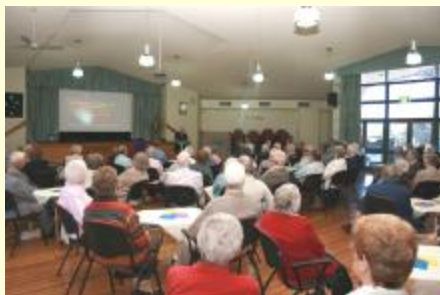
ARV Residents Computer Club Party

Since its formation in 1998, ARV management has supported the computer club in many ways including the purchase of equipment and particularly in the provision of premises and facilities. Those Computer Clubs which are constantly struggling to find suitable venues and pay ever increasing rents will be more than a little envious of this situation. Of course, it is in the interests of the Anglican Retirement Villages who promote the ideals of a healthy, useful and enjoyable lifestyle, to offer encouragement and support to the Computer Club volunteers who work towards those aims. However this kind of help and logic is not always encountered - with many clubs seeming to be thwarted by local councils and government bodies.