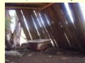
General "Bath Time"