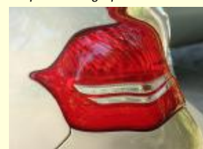
Enhanced General "Curves"