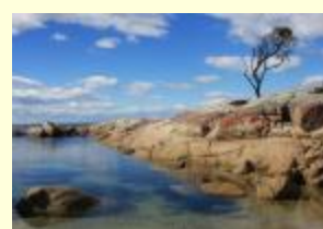
Landscape "Binnalong Bay Tasmania"