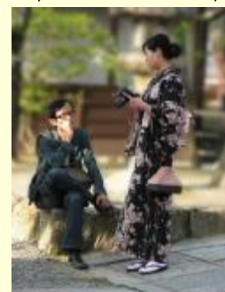
Enhanced People "Photographic Conference"