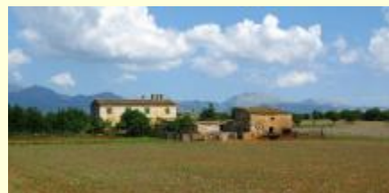
Enhanced Landscape "Mallorcan Landscape"