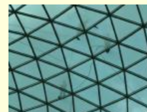
People "Roof Cleaning"