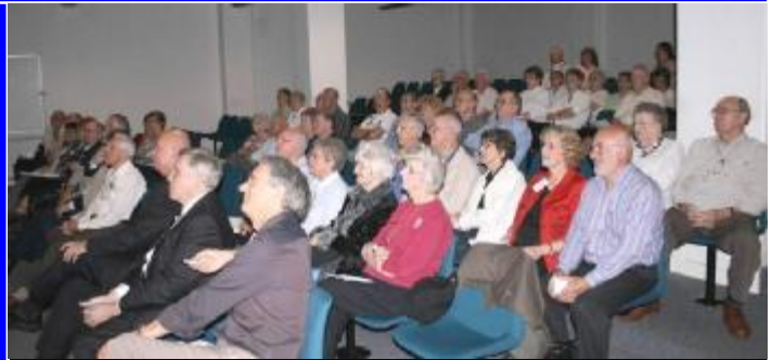
The Seventh ASCCA Annual General Meeting was held in Sydney on Thursday 20th November 2008